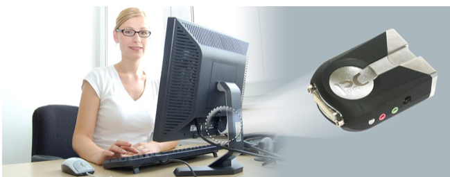
Plug PC High Multimedia Thin Client