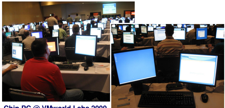
Chip PC @ VMworld Labs 2009