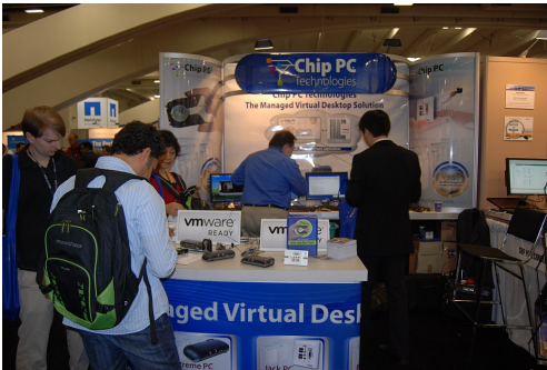
Chip PC Booth @ VMworld 2009